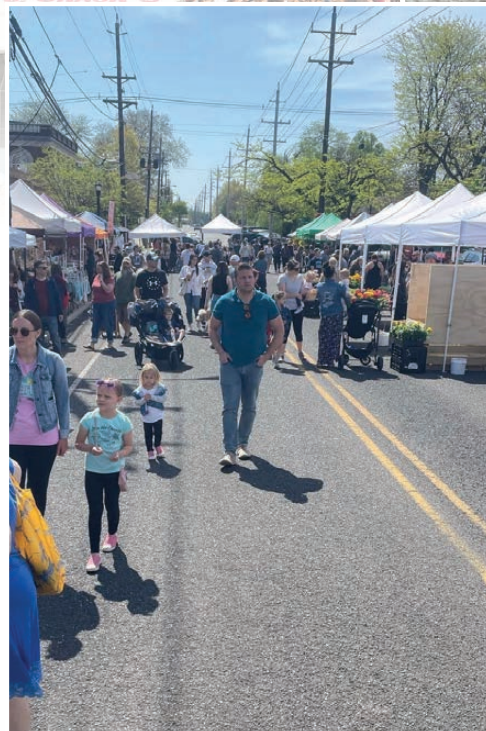
OUR BELOVED FARMER'S MARKET HAS RETURNED!

ANTHONY'S | HADDON HEIGHTS, NJ ANTHONYSONSTATION.COM