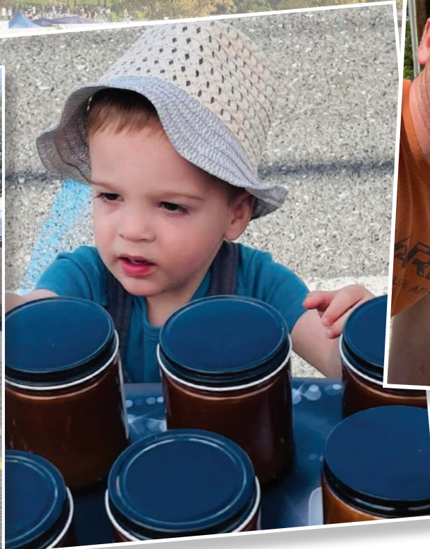
EVEN THE LITTLEST SHOPPERS ARE WELCOME AT THE FARMER'S MARKET!