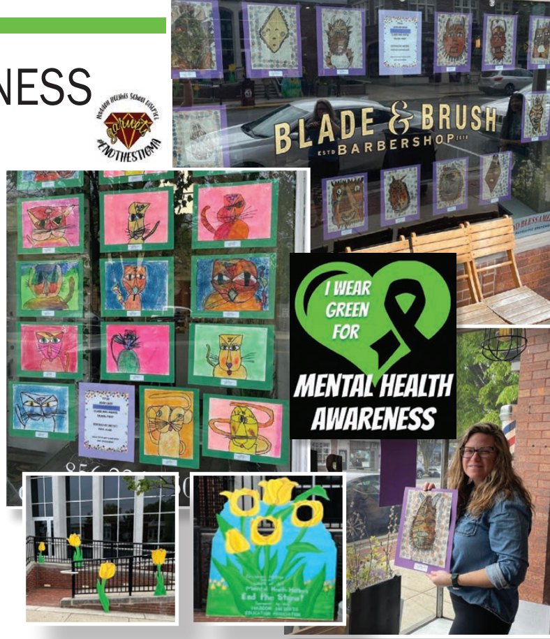
Children's Feelings Are a Work of Art!

A Living Art Installation was placed in business windows created by our elementary students, based on the theme: