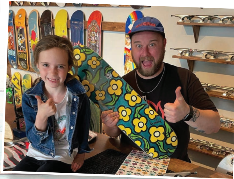
HANGING AT NEW THE SKATE SHOP IN TOWN! WELCOME TO HEIGHTS ANTICS SKATE SHOP

Don't let crabgrass ruin your summer, contact us to be put on our 7 Step Lawn Care program!