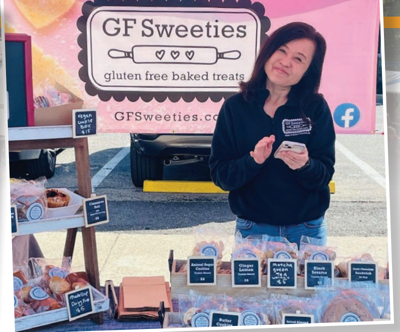
GF SWEETIES WITH LOTS OF GLUTEN FREE TREATS!